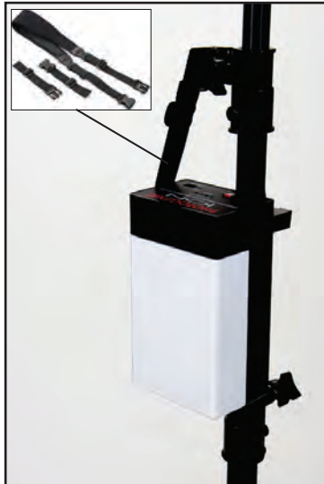
Flexible Strap Configurations for Both Shoulder or Stand Mounting