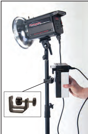
Convenient ION Multi-Clamp for Stand Mounting

Insert the ION Inverter so that it hangs in the ION Multi-Clamp slot. Make sure it is securely inserted into the clamp. The supplied Multi-Clamp and strap provides a variety of ways to mount the Photogenic® ION Inverter.