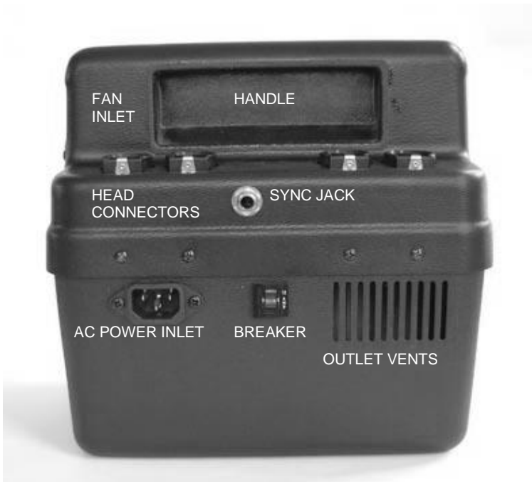
REAR VIEW OF PHOTOMASTER