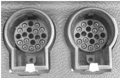
HEAD CONNECTOR TOP VIEW

The light head connectors are key-shaped, snap-in type and will only attach correctly. The plugs must be inserted until the locking snap is heard. Press the flat metal inset to release. The mating pins are automatically lubricated during each insertion and withdrawal to greatly extend the life of these connectors.